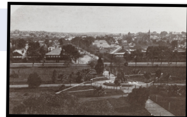
RUSSELL SQUARE, PERTH C.1914 | 696B/8