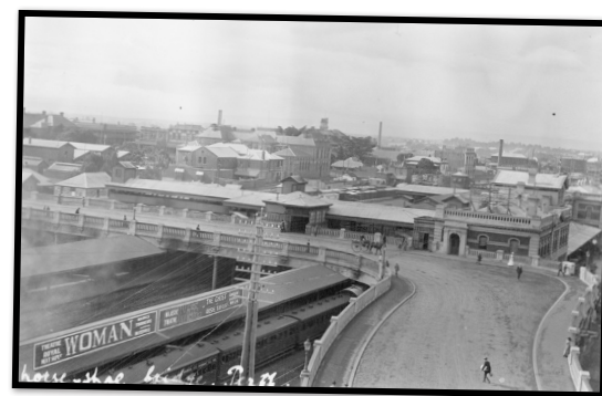
HORSESHOE BRIDGE, C.1919 | 013607D

From here you can see the State Theatre Centre and the Horseshoe Bridge which takes traffic over the railway line. The area became known as Northbridge around 1970. The railway transported people and goods around the state and was crucial to new migrants seeking work.