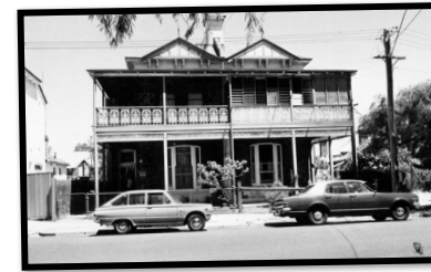
27/29 MUSEUM ST | 005799D

In the late 19th century, there was a rapid expansion of building in Western Australia during the gold boom when many new migrants arrived.