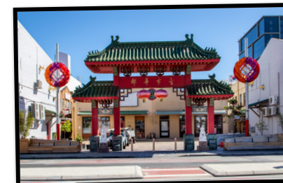
CHINESE GATES, 2020

The State Library of WA has a collection of restaurant menus which offer historians clues to the history of migration.