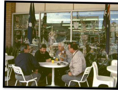
OUTSIDE THE RE STORE C.1990 | 134990PD