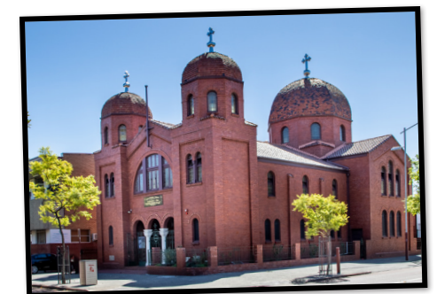
GREEK ORTHODOX CATHEDRAL 2020

The first Greek people who came to Australia arrived in the 1820s, there have been many waves since. Many arrived between the 1950s and 1970s.