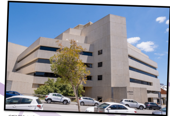
STATE LIBRARY BUILDING FROM FRANCIS STREET, 2024

Enquire at the Welcome Desk about becoming a member of the State Library, it's free!