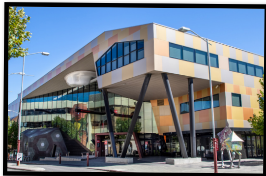
NORTH METROPOLITAN TAFE 2023

Today, international students and new Western Australians can access classes at North Metropolitan TAFE, including English tuition. During the pandemic, population decreased in all states. In the five years prior to the pandemic, a net gain was recorded (Source: ABS). Flows of migration change all the time.