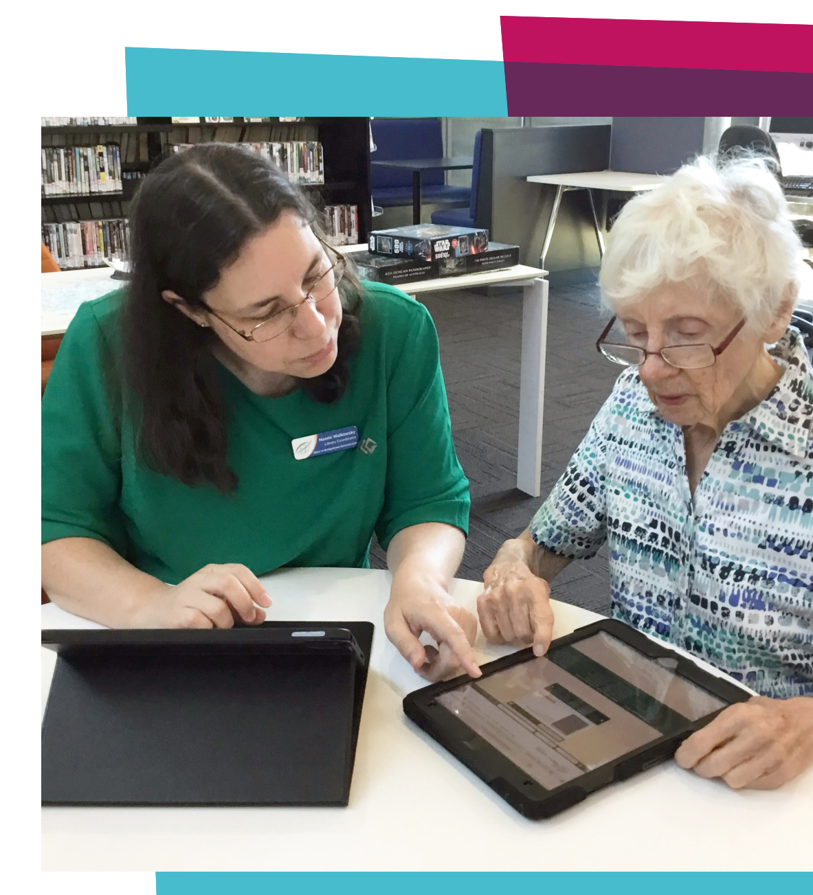
Shire of Bridgetown-Greenbushes

A vibrant and sustainable 21st century public library network at the heart of the Western Australian community where people can connect, learn and grow.