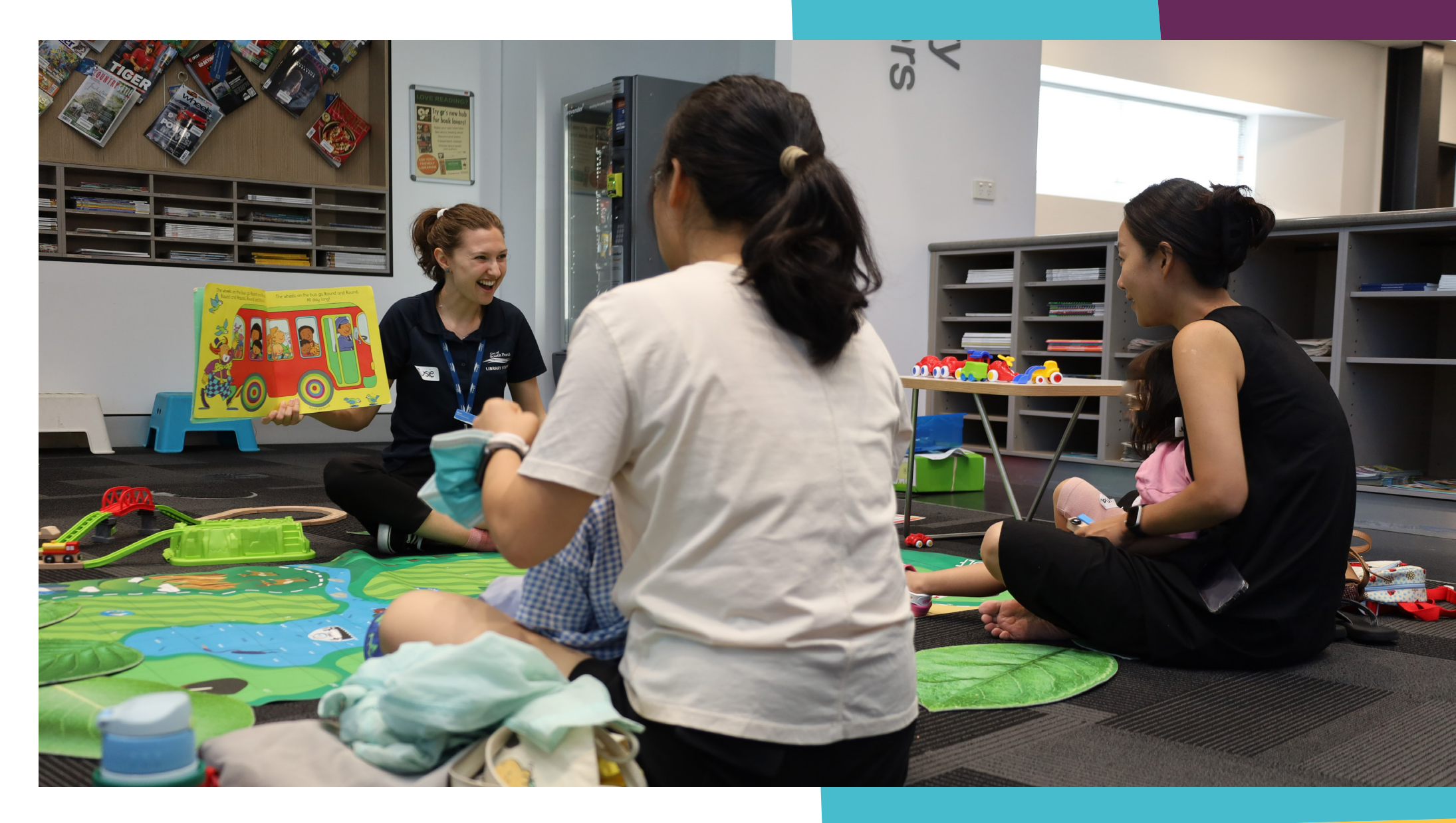
City of South Perth. Cover image: Shire of Boyup Brook.