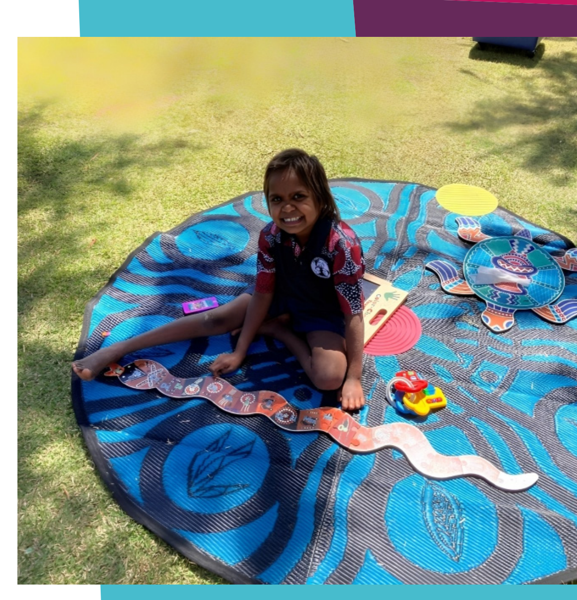
Town of Port Hedland

Project groups will evaluate the outcomes they have delivered using this methodology and report the results to PLWG. Evaluation will measure progress towards achieving the aims of the strategy and inform future initiatives.