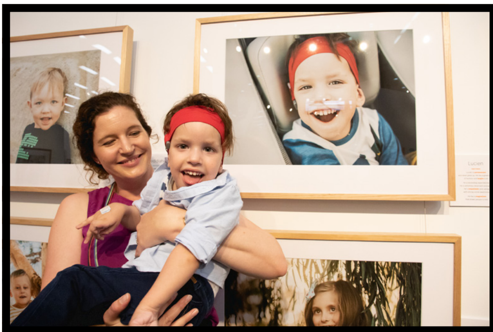
Above: Super Power Kids, 2019