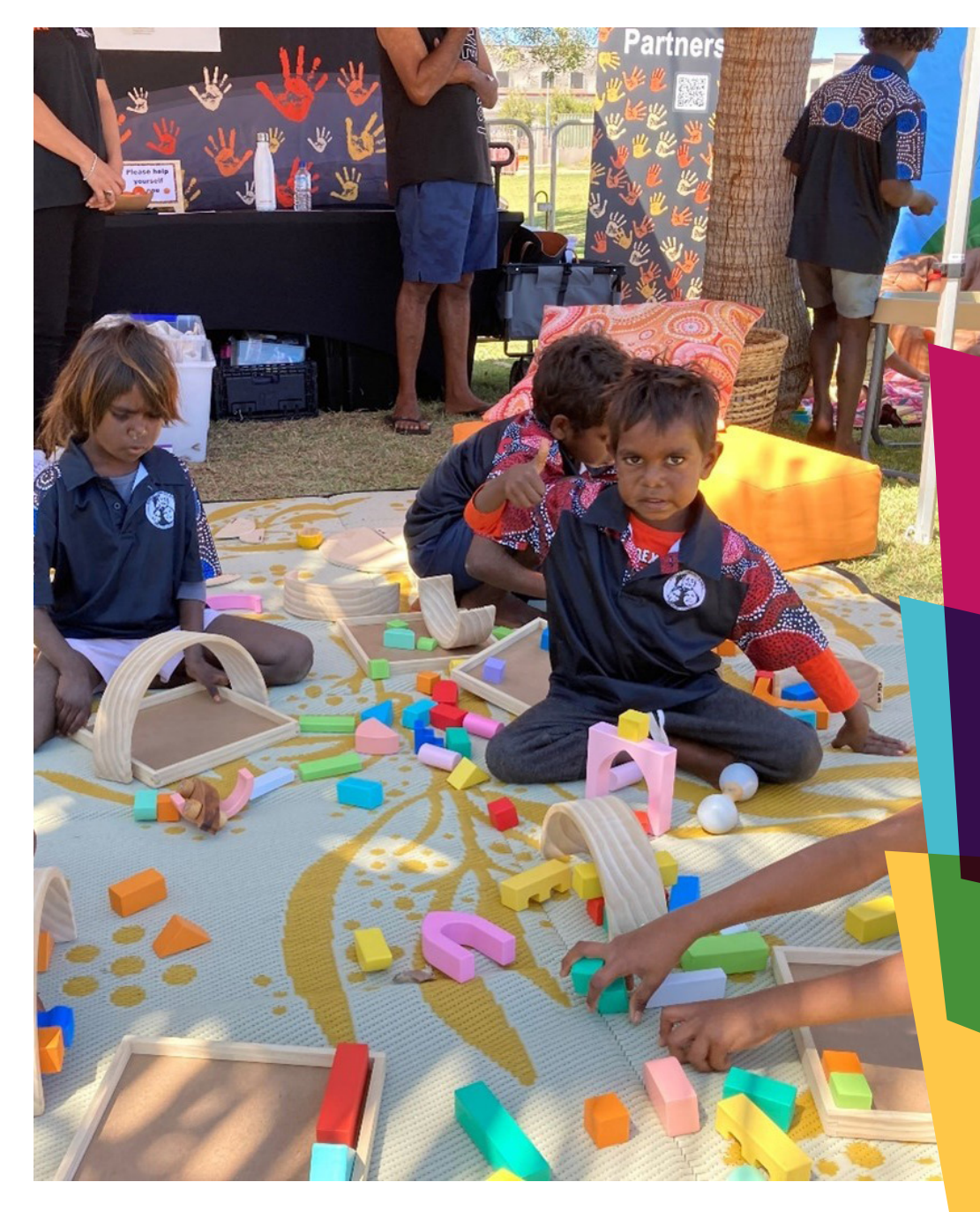
Town of Port Hedland

PLWG will assess and approve planning and resourcing for all actions under the Strategy. Project groups will report regularly to PLWG on the delivery and outcomes of their actions.