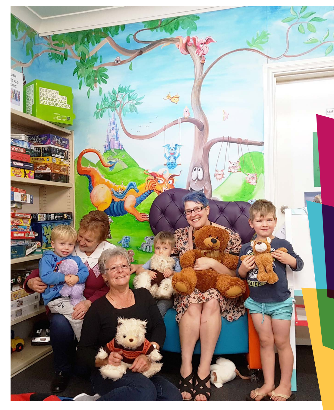
Shire of Chittering

Project groups will evaluate the outcomes they have delivered using this methodology and report the results to PLWG. Evaluation will measure progress towards achieving the aims of the strategy and inform future initiatives.