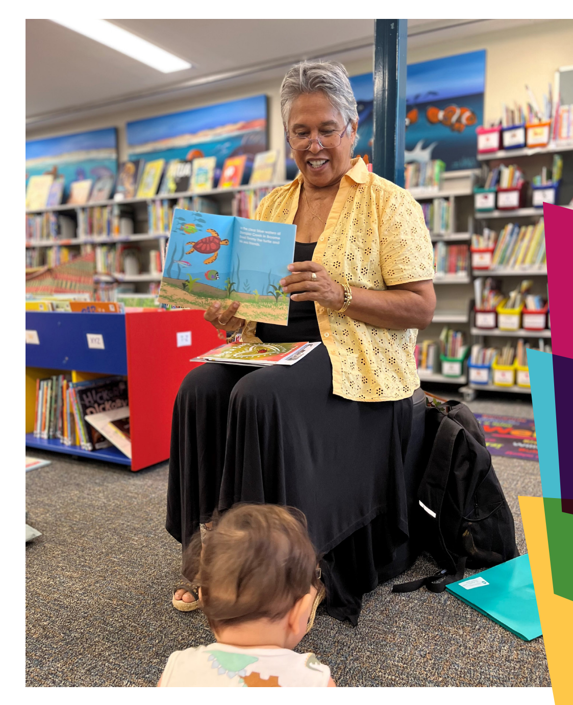
Shire of Broome

A vibrant and sustainable 21st century public library network at the heart of the Western Australian community where people can connect, learn and grow.