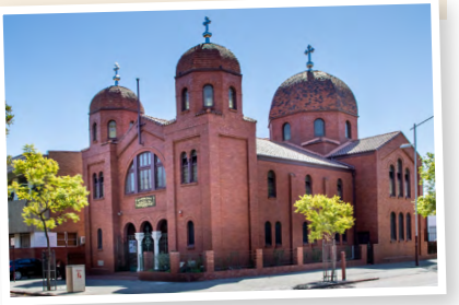
GREEK ORTHODOX CATHEDRAL

The first Greek people who came to Australia arrived in the 1820s. There have been many waves of Greek migration since then. The largest periods of migration