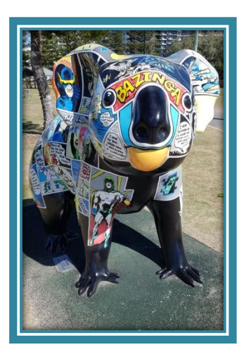
Gold Coast Sculpture Trail, Comic Book by Kate Clarke

Three local councils partnered to run Beyond the page during a two-week school holiday period. The focus was to engage children and young people in fun and exciting literacy and learning opportunities, including providing a platform for young people to create, celebrate and share their own content. Activities included drag queen storytime, meet the robots, ballet storytime, a murder mystery activity, and scavenger hunts. The large-scale nature of the event encouraged library staff who did not usually run events to get involved. These activities challenged the perceptions of a traditional library and encouraged community members to participate in a wide range of learning experiences. The project has had additional ongoing benefits such as the partnerships that were made have expanded to include joint professional development and continued opportunities to share knowledge between library staff.