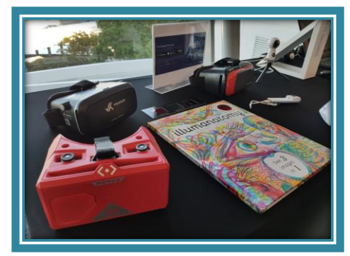
Sample of workshop resources, APLIC 2018

Augmented reality is creating numerous possibilities for libraries, not only for programs but also to add value and further learning opportunities to collections. There are programs that allow library staff to layer information onto a physical item including discussion questions, activities, links to videos or other sources of further information, links to social media and