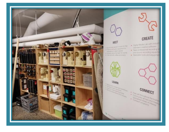
Sewing resources and a promotional banner