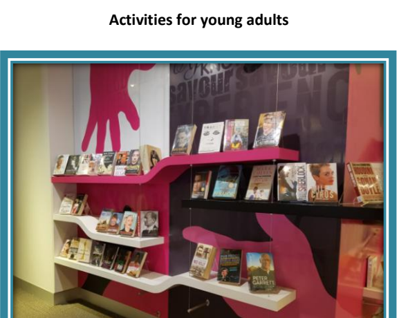
Forward facing displays