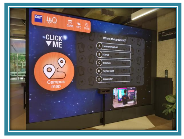
Interactive campus map

The ground floor of this university library dubbed HiQ is a buzz of activity. This space is bright and welcoming, with staff members readily available to assist with any questions. There is a variety of interactive technology that can allow students to access the information they need. The remaining floors of the library house the collection as well as a mix of quiet and collaborative study spaces as well as an after-hours computer study space and outdoor courtyard. The library has significantly reduced the physical collection to allow for more of these spaces. This has been supported by a growing online collection. As the spaces are consistently used, there are terminals where students can book particular spaces and time limits for bookings.