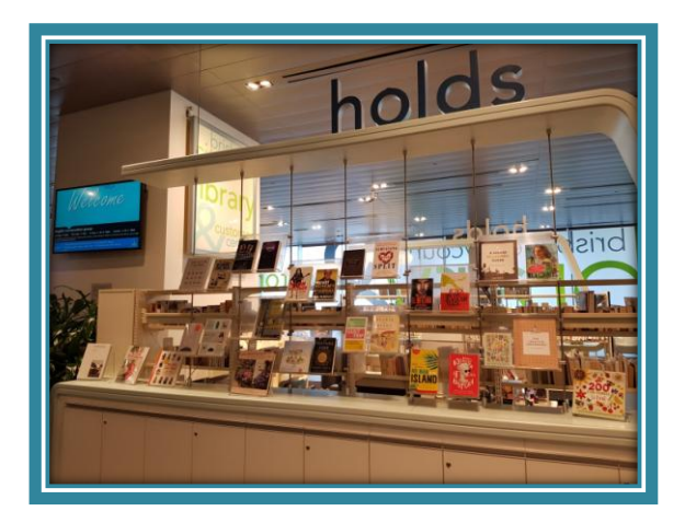
Forward facing holds