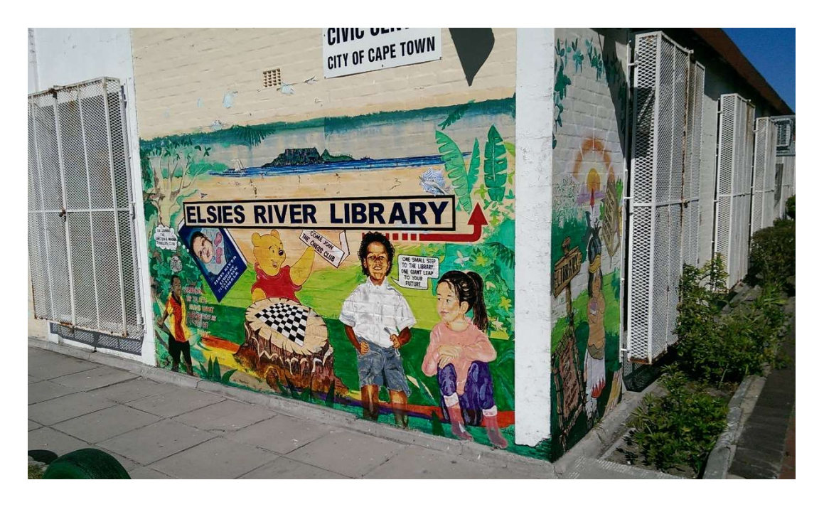
Figure 8 Elsies River Library exterior