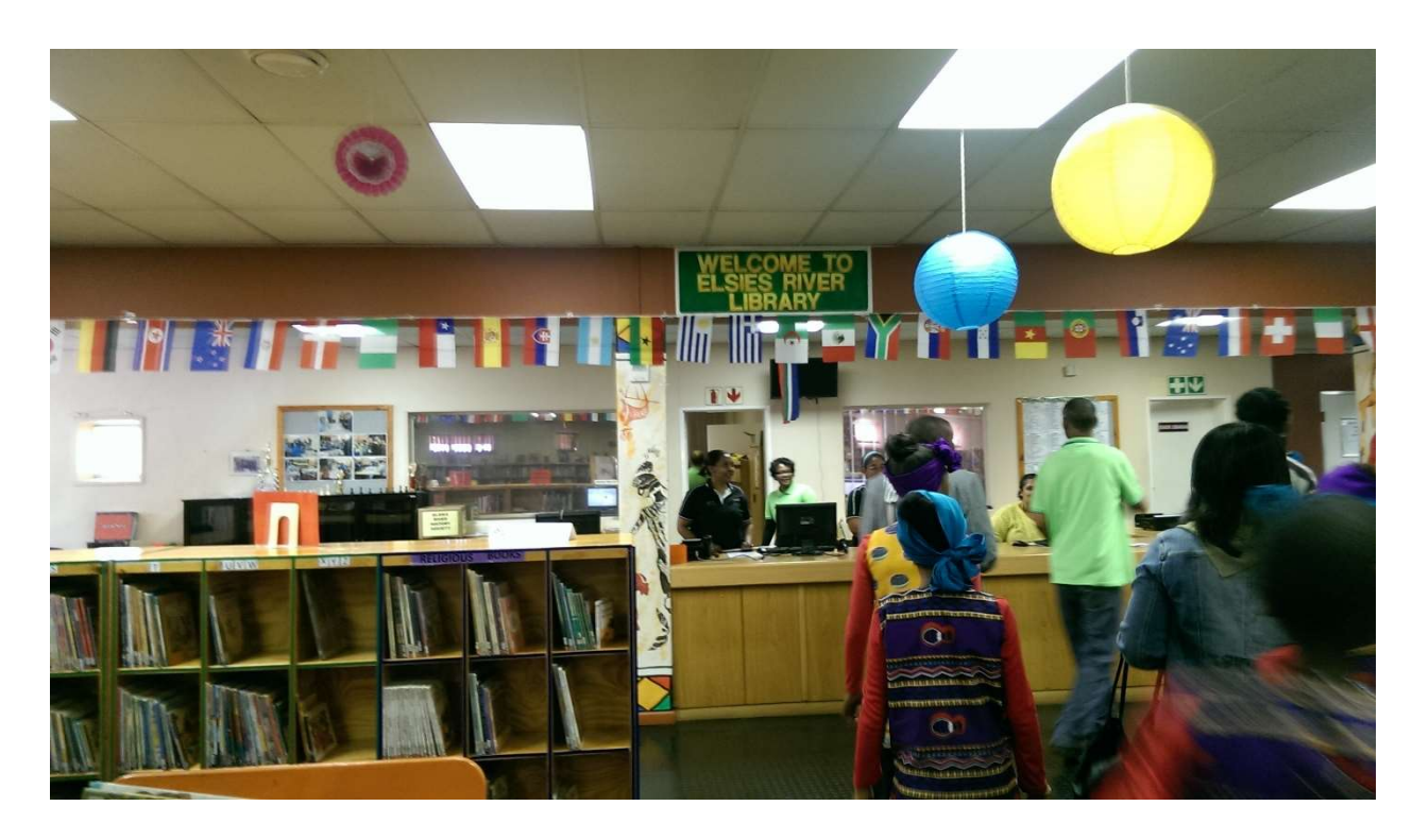
Figure 10 Elsies River Library interior