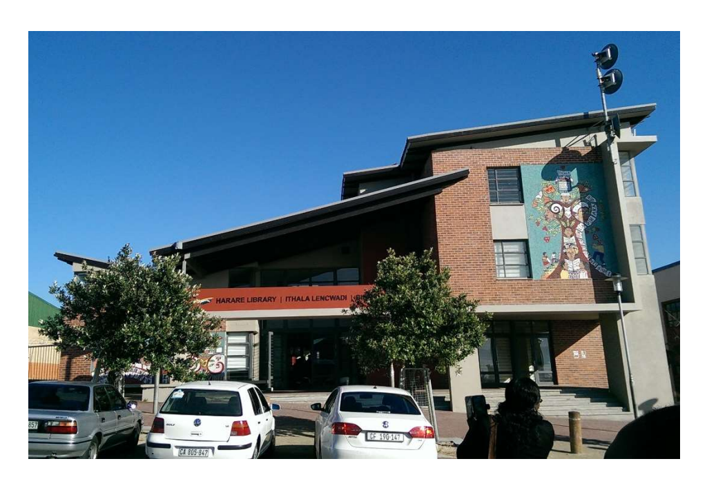
Figure 1 Harare Library front

• For children with no access to technology at home, the library provides exposure to allow them to develop the ICT skills that will allow them to succeed at school in the current information environment.