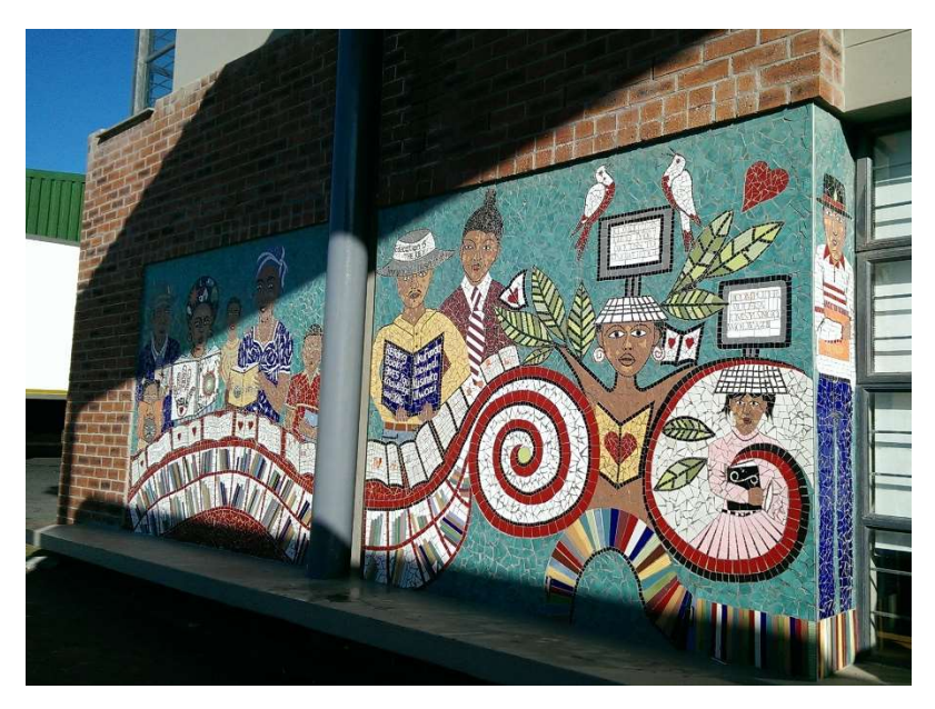
Figure 2 Harare Library exterior community artwork