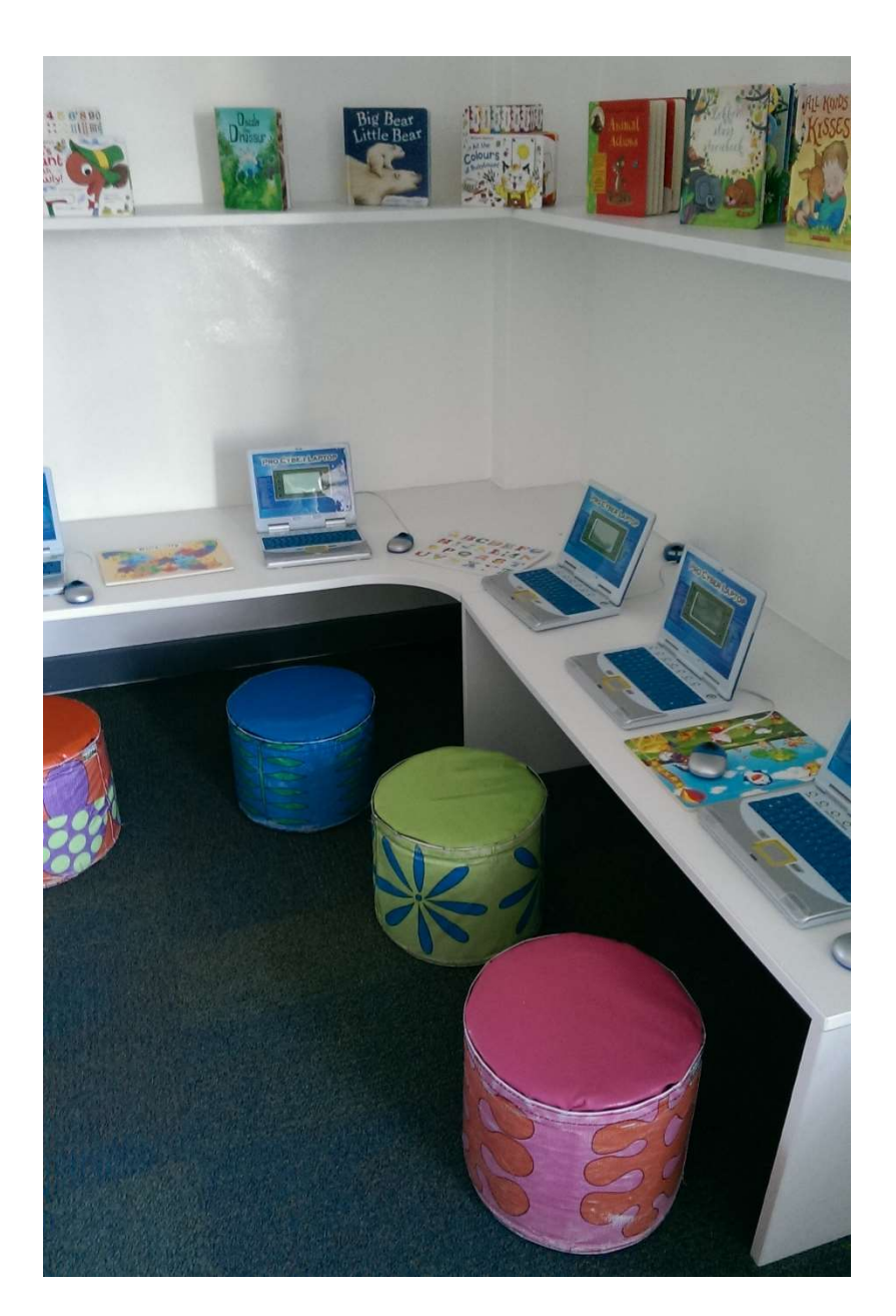
Figure 6 Fundla Udlale - mini laptops