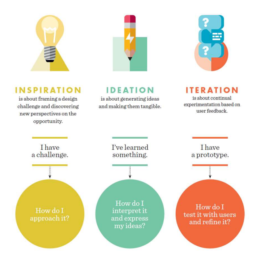
(IDEO, p. 3)

Design Thinking starts with a "design challenge", identified by asking questions about the library and its services, for example: