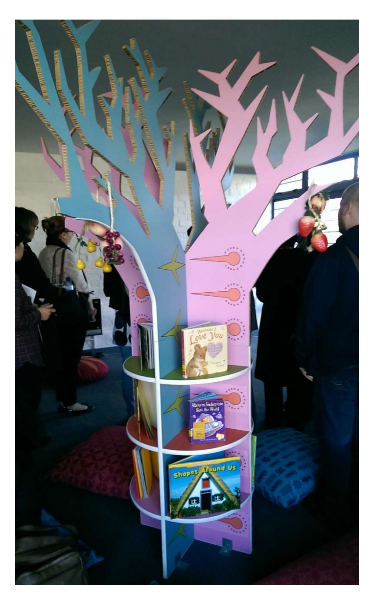
Figure 5 Fundla Udlale