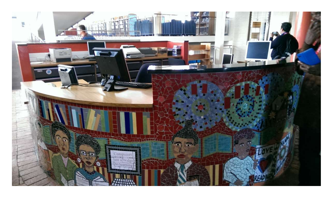
Figure 3 Harare Libary interior community artwork - circulation desk