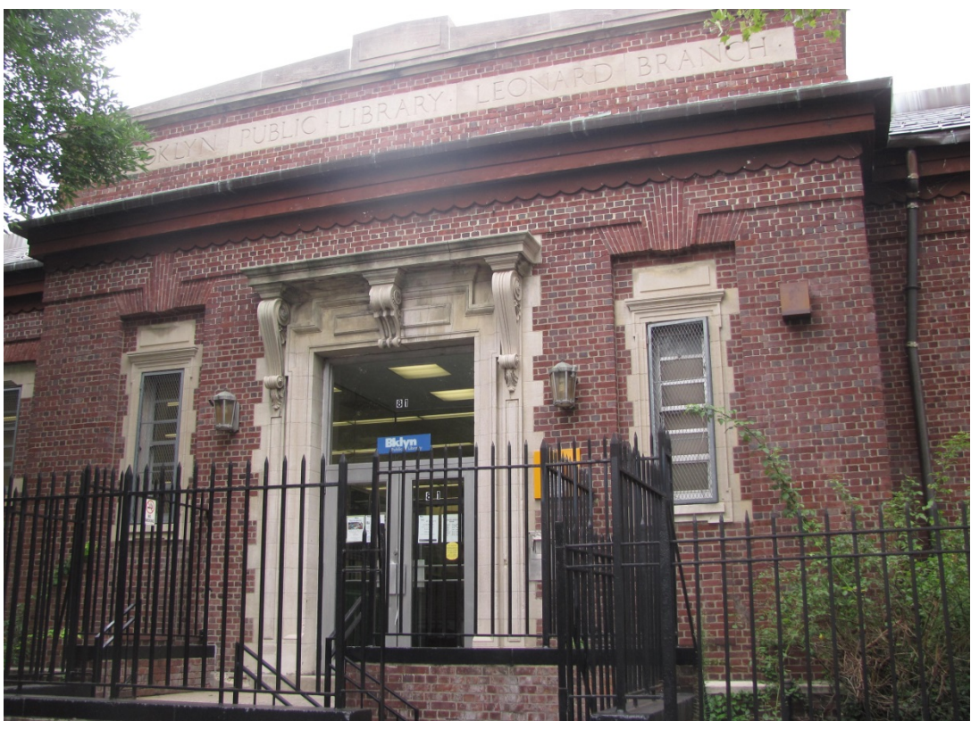
6. Old Carnegie Library in NY suburb still being well used

Kay Poustie Scholarship 2013 Ruth Campbell-Hicks Page 22 of 22