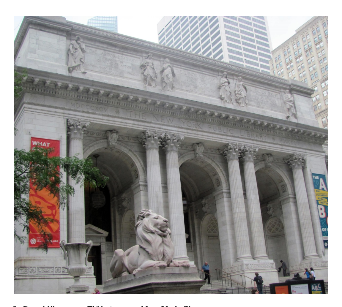
5. Grand library on Fifth Avenue, New York City