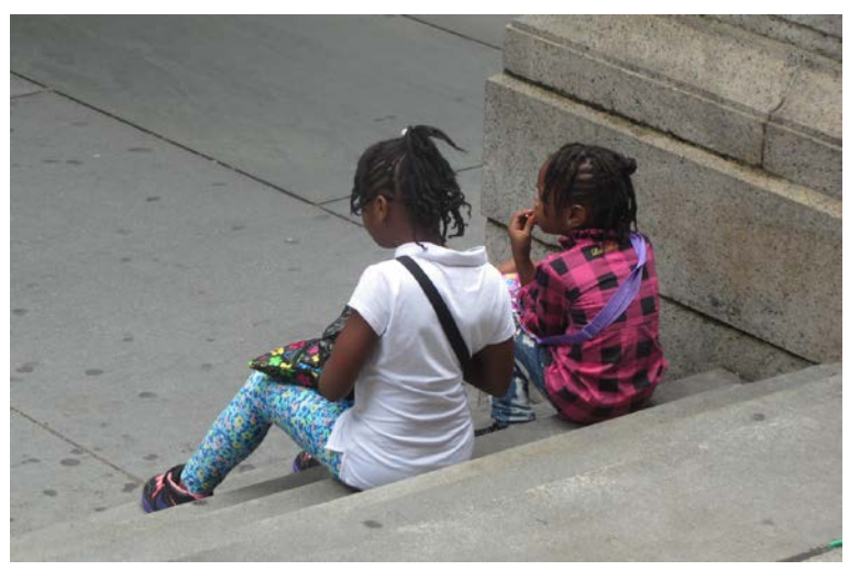
At New York Public Library

With a customer focus and philosophy of constant improvement, I hope that library staff will sift through these ideas to find what will work for them – and thus improve the early literacy skills of our young children. In turn this will lead to an improved future in employment, financial security, relationships, continuing education, health, social integration and happiness for those children.