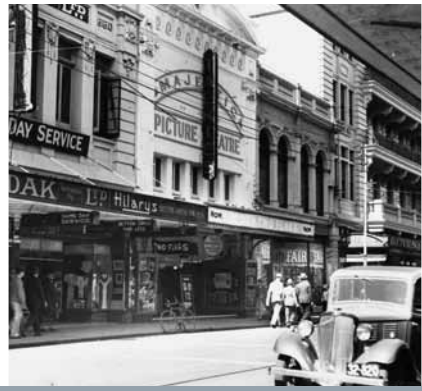
↑ Majestic Picture Theatre c1936 (SLWA 007327d)