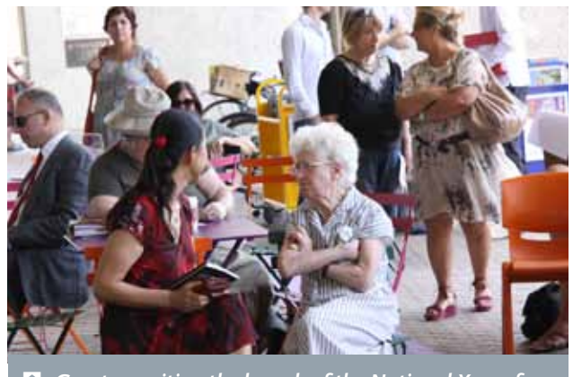
Guests awaiting the launch of the National Year of Reading and the Love2Read Café January 2012

The State Library continues to maintain a successful partnership with the Western Australian Department of Health libraries with its shared library management system (LMS) consortium. The partnership arrangement commenced in 2009, and has allowed the libraries to provide improved services to clients through sharing costs and skills. During 2012, all libraries in the consortium were able to implement book cover art and reviews in their online catalogue, greatly improving the client experience.