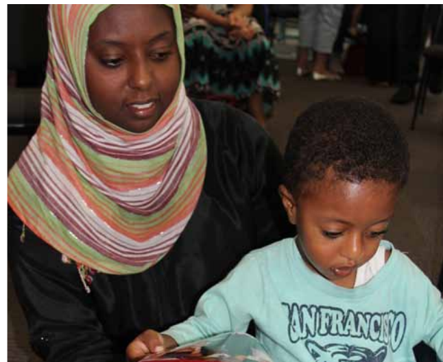
Better Beginnings reaches the remote Tjuntjuntjara community and all areas of Western Australia