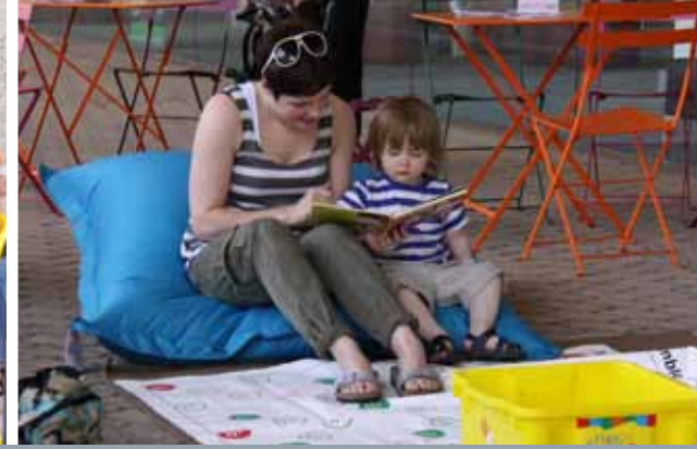
Activities and promotion of the Love2Read Café as part of the National Year of Reading