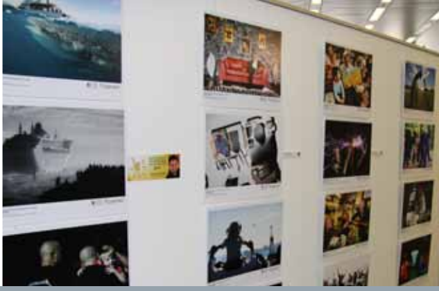
Mest Australian Press Photographer of the Year Awards presented in The Gallery area on the Ground Floor.

Graphic images of architectural plans, real estate maps, town planning records, notebook sketches and urban developments were displayed along with historical photographs and documents from the collections that provided an insight into past urban and city planning.