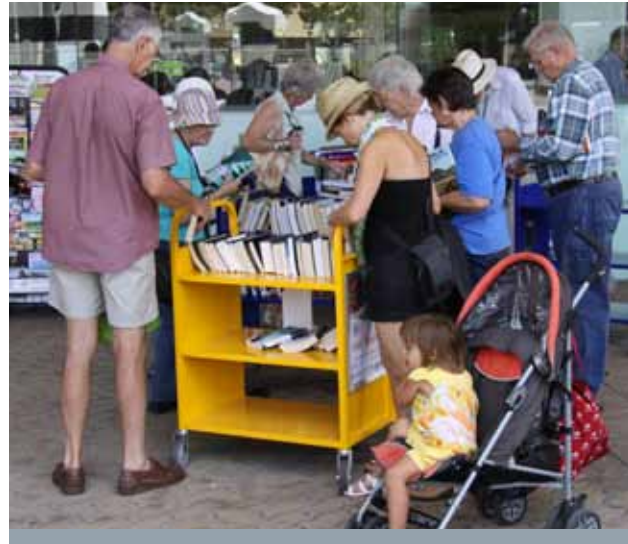
Clients look through books available to read as part of the Love2Read Café