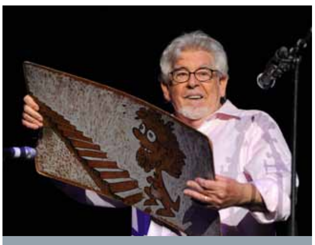
■ Entertainer and TV personality Rolf Harris in Paper to PCs exhibition

From papers to PCs was an exhibition based around the Cruthers Media Archive and told the story of the media in Western Australia. As well as featured items from the Sir James Cruthers Media Archive collection, the exhibition included equipment and materials on loan from Channel 7, the Western Australian Museum and the Australian Museum of Motion Picture and Television, photographs and ephemera from the Library's collection, and an excerpt