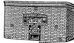
NEW PATENT CONTINUOUS OVEN,