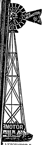
"AERMOTOR" Patented Steel Tower mill, 30 to 80ft. high. T. 6

Telegraphic Address: "HOLLINGTON, LONDON."