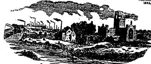
A VIEW OF KIRKSTALL ABBEY 3 1/2 MILES WIDE LEEDS WITH THE FORGE IN THE DISTANCE. FOUNDED ANNO DOMINI 1152.

SPECIALITIES: TURNING IRON. SCREW IRON. CABLE IRON.